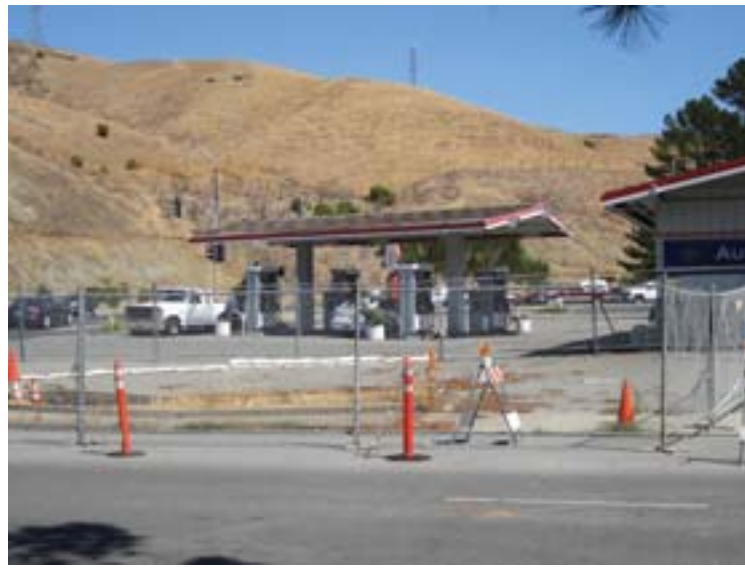
Rheem sinkhole still awaits repairs.